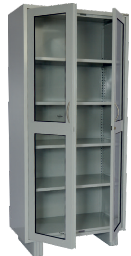
VGDOA 001 GLASS DOOR OFFICE ALMIRAH WITH TOUGHENED GLASS