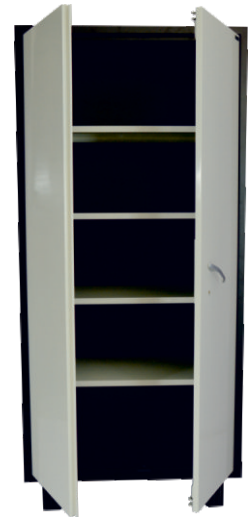
VOA 001 OFFICE ALMIRAH WITH 4 FIXED SHELF