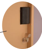
Covered edges from inside to provide protection to clothes of the user