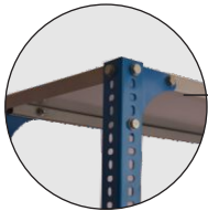
SLOTTED ANGLE RACK

Double bolts and extra strengthening of the shelf edges for increased load bearing.